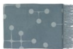
Eames Wool Blanket light blue