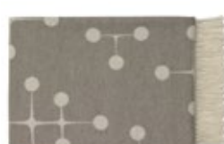
Eames Wool Blanket taupe