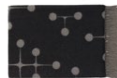
Eames Wool Blanket black