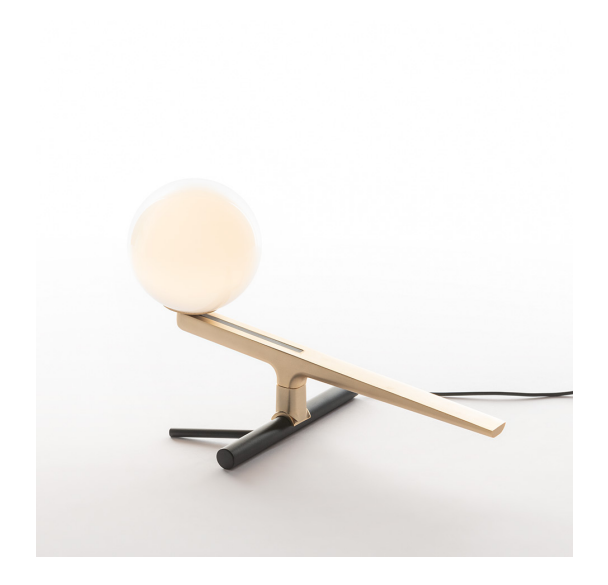
IP20 🕸 🏽 C E