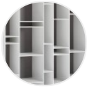
Matt lacquered white X042