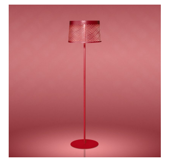
Twiggy Grid Lettura