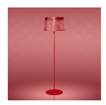
Twiggy Grid Lettura