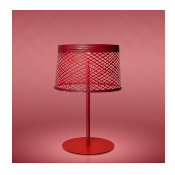
Twiggy Grid XL