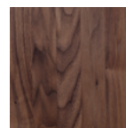
→ Oiled Walnut