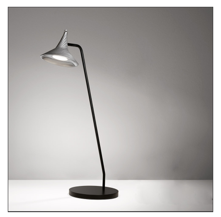
IP20 💮 ce