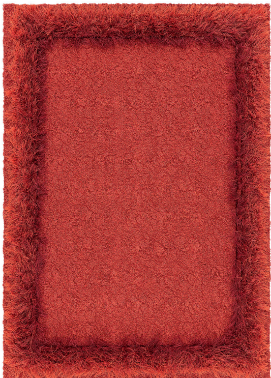
Rug 170x240 cm, Flamingo 100

Design ELLINOR ELIASSON Hand tufted bouclé rug in pure wool and linen