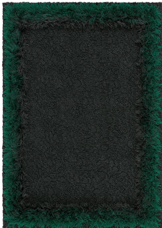
Rug 170x240 cm, Peacock 501