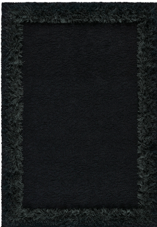
Rug 170x240 cm, Raven 502