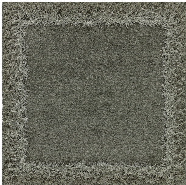
Rug 240x240 cm, Nandu 500