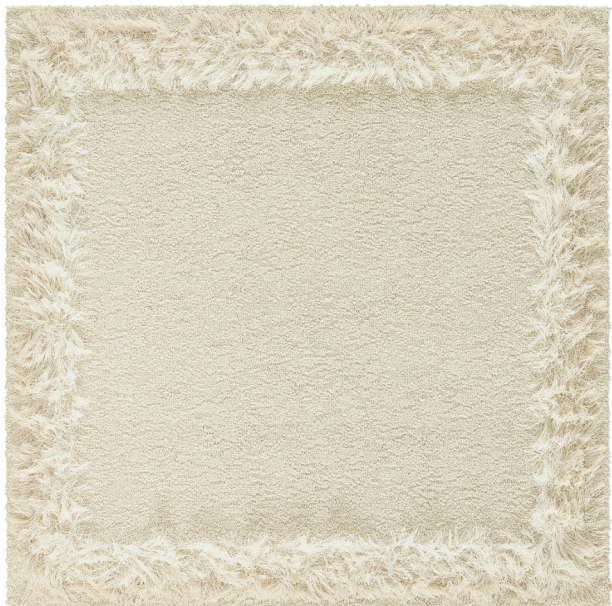
Rug 240x240 cm, Swan 801

Design ELLINOR ELIASSON Hand tufted bouclé rug in pure wool and linen