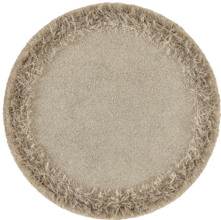
Rug round: Ø 240 cm, Heron 800