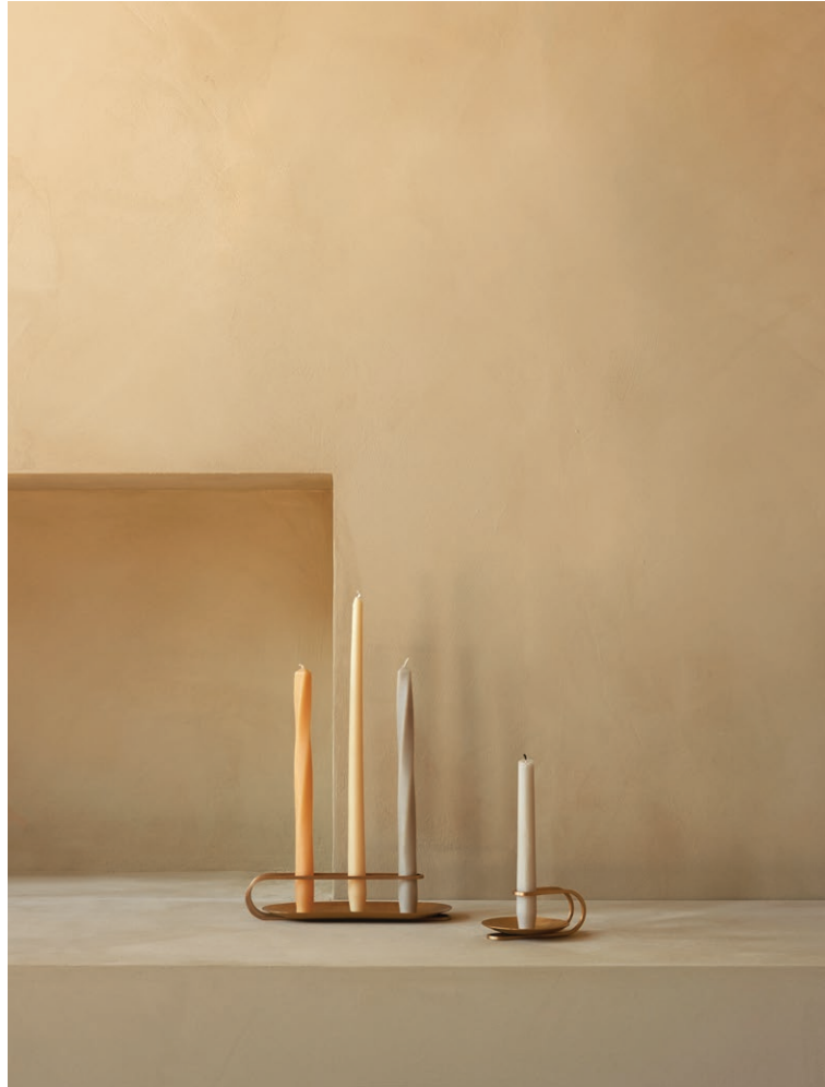
CLIP CANDLE HOLDER, TABLE Designed by Audo