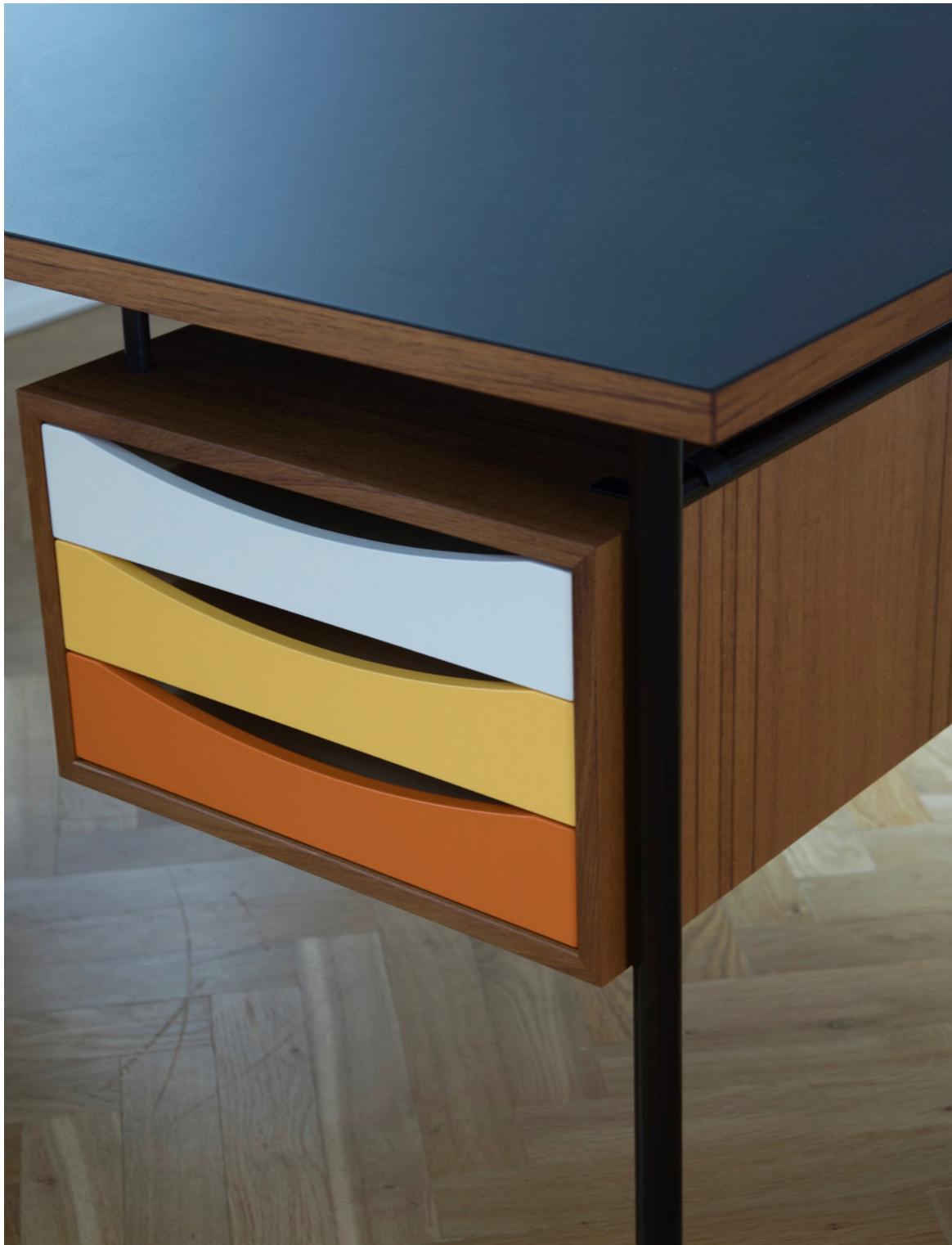
NYHAVN DESK 1945 BY FINN JUHL