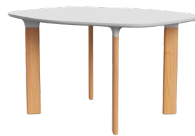
TABLETOP: LAMINATE, WHITE TRUMPET: ALUMINIUM, WHITE LEGS: SOLID WOOD, OAK

The Analog™ table is available in the following standard configurations: