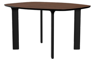
TABLETOP: VENEER, WALNUT TRUMPET: ALUMINIUM, BLACK LEGS: SOLID WOOD, BLACK LACQUERED OAK