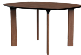
TABLETOP: VENEER, WALNUT TRUMPET: ALUMINIUM, BLACK LEGS: SOLID WOOD, WALNUT