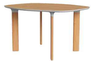
TABLETOP: VENEER, OAK TRUMPET: ALUMINIUM, WHITE LEGS: SOLID WOOD, OAK