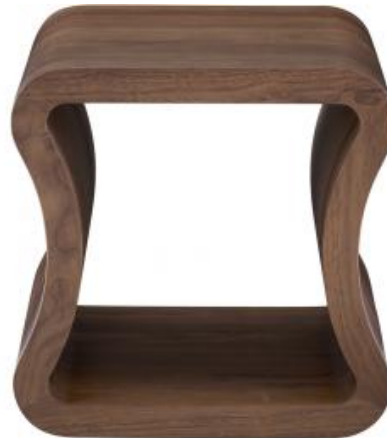
SOFA END TABLE NATURAL OAK