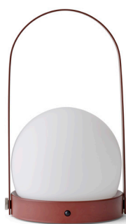
Burned Red 4863349