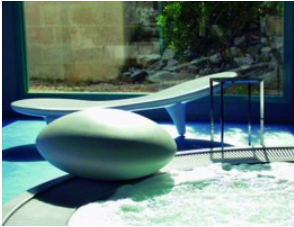
BRETANIDE HOTEL - BOL