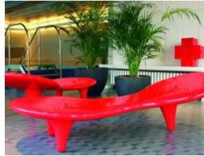
ATLANTIC KEMPINSKY - HAMBURG