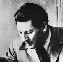
Gerrit Thomas Rietveld

Gerrit Thomas Rietveld, born in Utrecht on 24 June 1888, seems possessed of two personalities, each so distinct that one might take his work to be that of more than one artist. The first personality is that seen in the craftsman cabinet-maker working in a primordial idiom, re-inventing chairs and other furniture as if no one had ever built them before him and following a structural code all of his own; the second is that of the architect working with elegant formulas, determined to drive home the rationalist and neoplastic message in the context of European architecture. The two activities alternate, overlap, and fuse in a perfect osmosis unfolding then into a logical sequence. In 1918 Rietveld joined the "De Stijl" movement which had sprung up around the review of that name founded the year before by Theo van Doesburg. The group assimilated and translated into ideology certain laws on the dynamic breakdown of compositions (carrying them to an extreme) that had already been expressed in painting by the cubists: the "De Stijl" artists also carefully studied the architectonic lesson taught by the great Frank Lloyd Wright, whose influence was widely felt in Europe at that time.