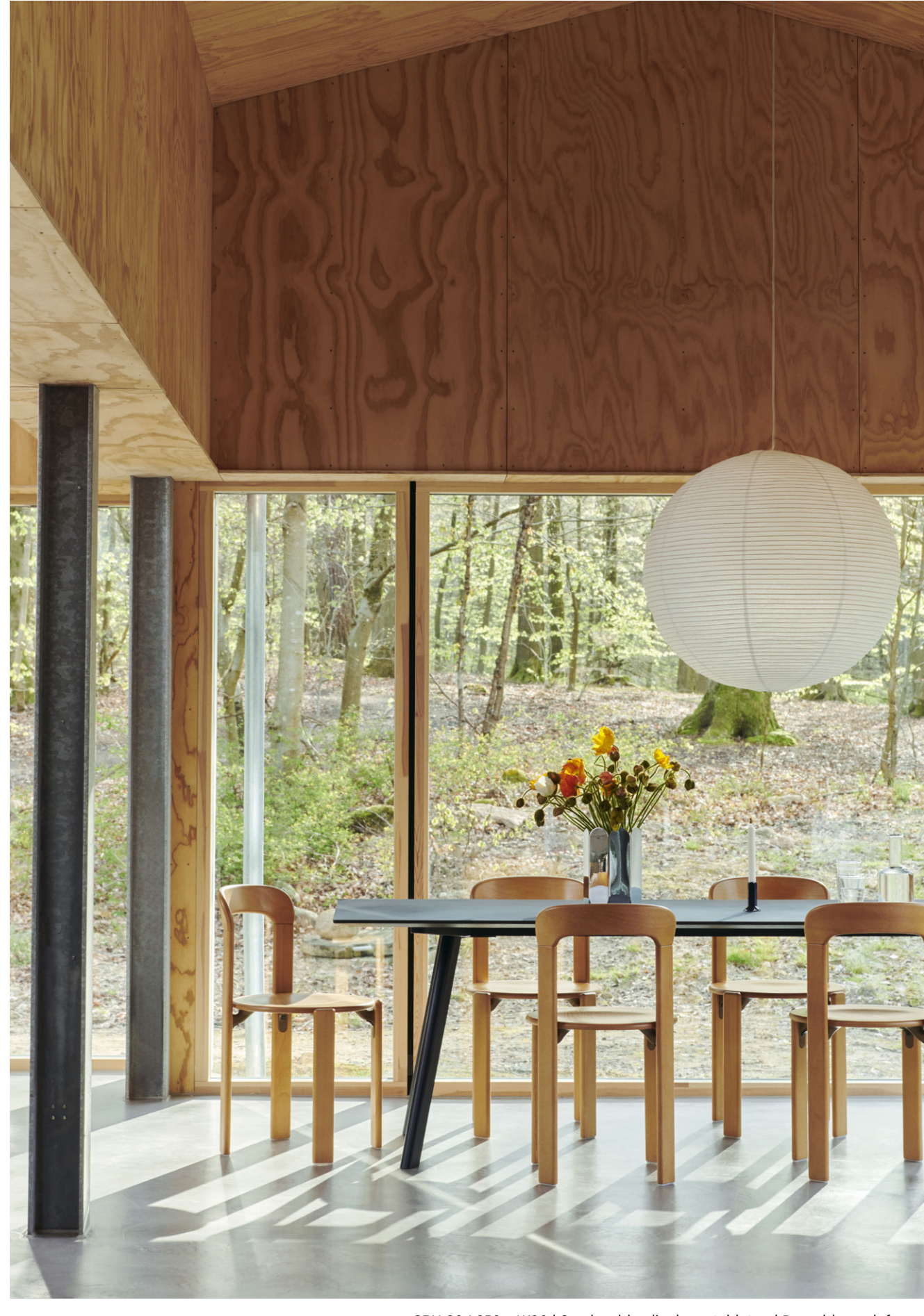
CPH 30 L250 x W90 | Smokey blue linoluem tabletop | Deep blue oak frame

Part of the Copenhague range designed by Ronan and Erwan Bouroullec, the CPH30 shares the same characteristic angled legs and strong identity that are consistent with the rest of the series, while this variant has a rectangular tabletop. It is available in different sizes, with tabletops and frames in a variety of wood types and materials, offering the possibility to select matching or contrasting combinations. The CPH30's versatility and uncluttered design make it ideal for using as a desk, conference table, or dining table in an office context or a private setting.