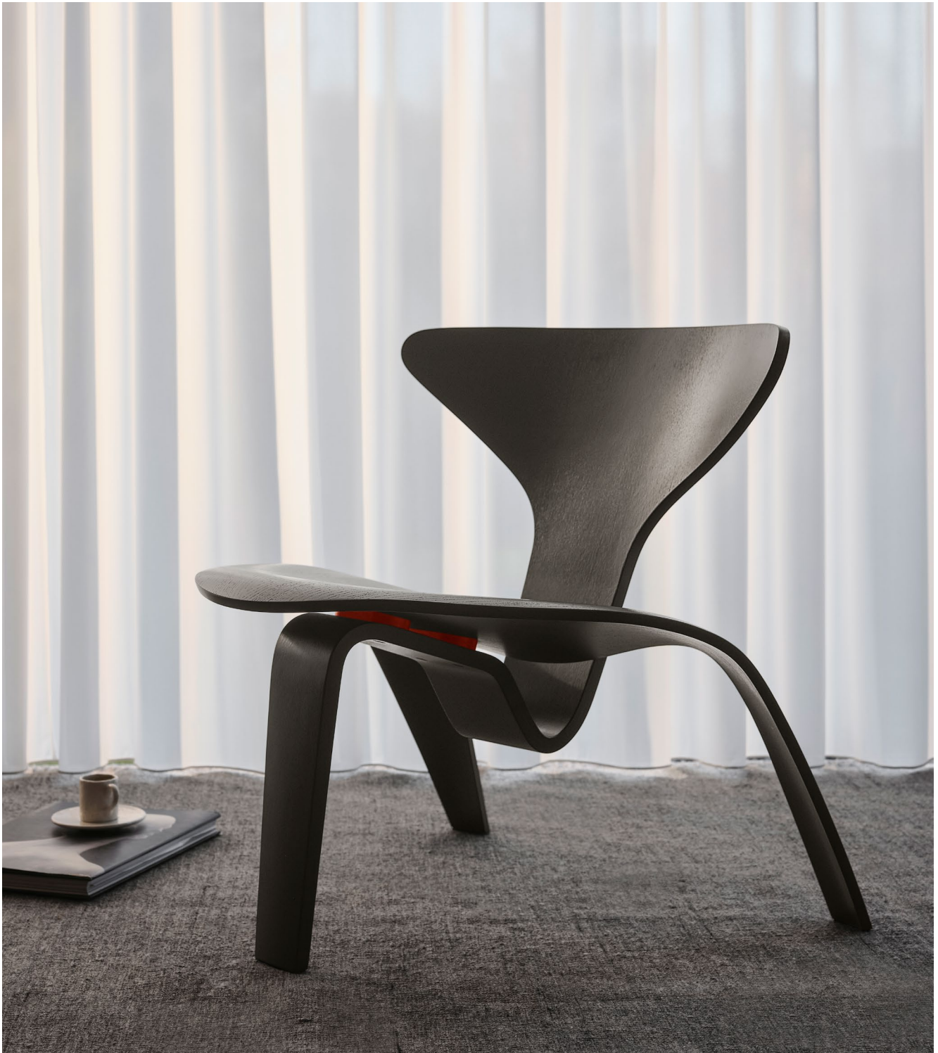
PKO A™ PRODUCT FACT SHEET