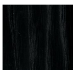
BLACK COLOURED ASH