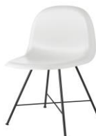
// White Cloud