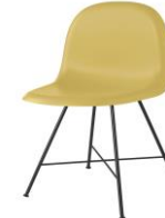
// Venetian Gold