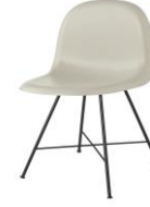
// Moon Gray